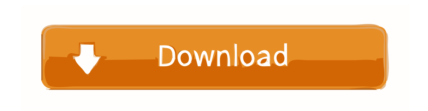
Postman 7.17.0 Crack With Keygen Free 2020 Download